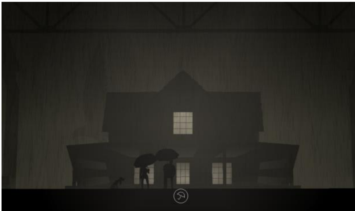
Image 1. Scene from Kentucky Route Zero Act II (2013). The main characters are waiting for a giant eagle to carry them away from the corporate Museum of Dwellings.

Welsh 2020). This association may be even more surprising, as the game does not visually resemble Twin Peaks . The look of the game is minimalist and clean; it has very few ‘cinematic’ segments and heavily relies on text dialogues.