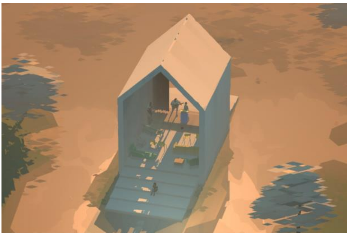
Image 2. Scene from the finale of Kentucky Route Zero Act V (2020). The look of the game became more sophisticated in the process of development, especially in its depiction of space.