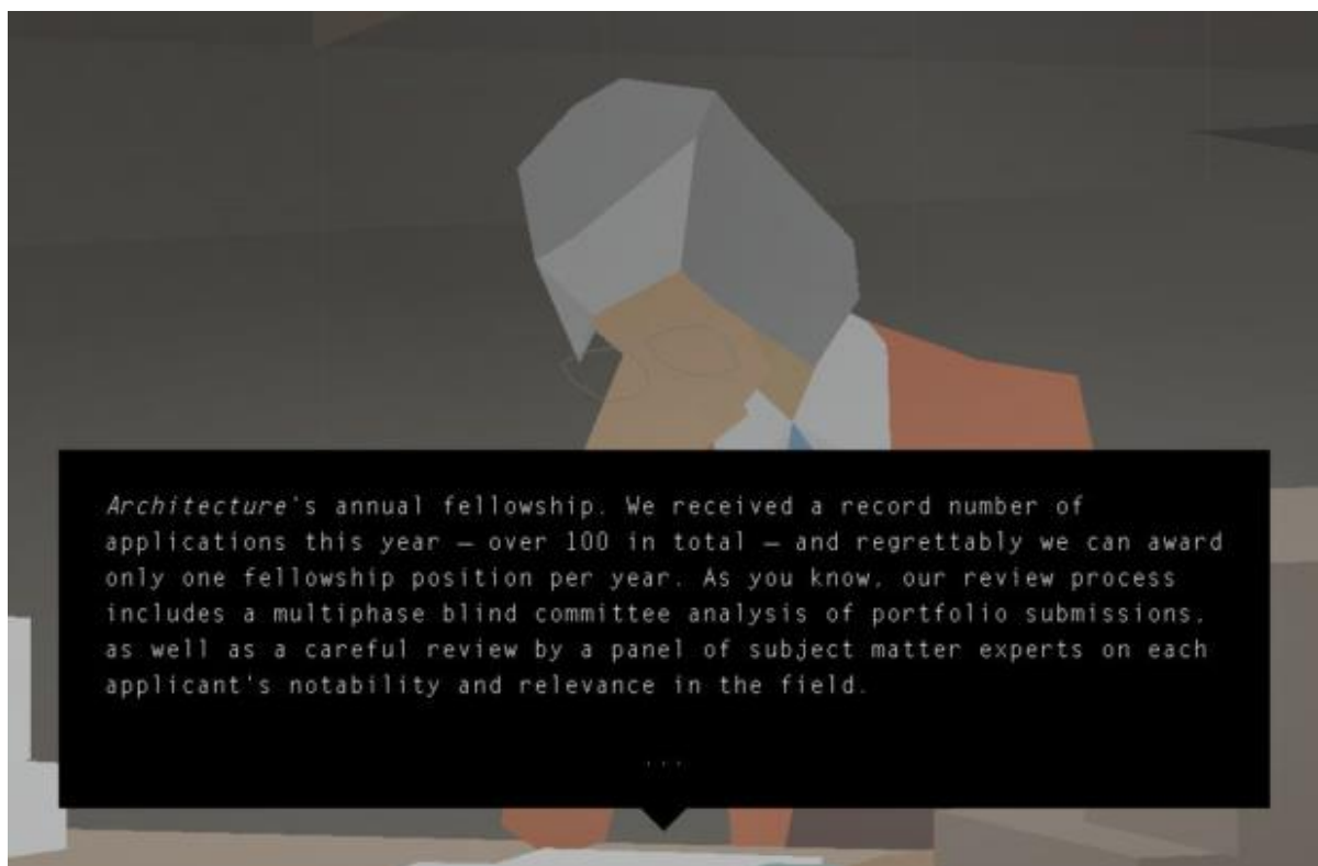
Image 4. Scene from Kentucky Route Zero Act II (2013). Lula Chamberlain is shown reading a rejection letter, probably a parody of the academic review process.