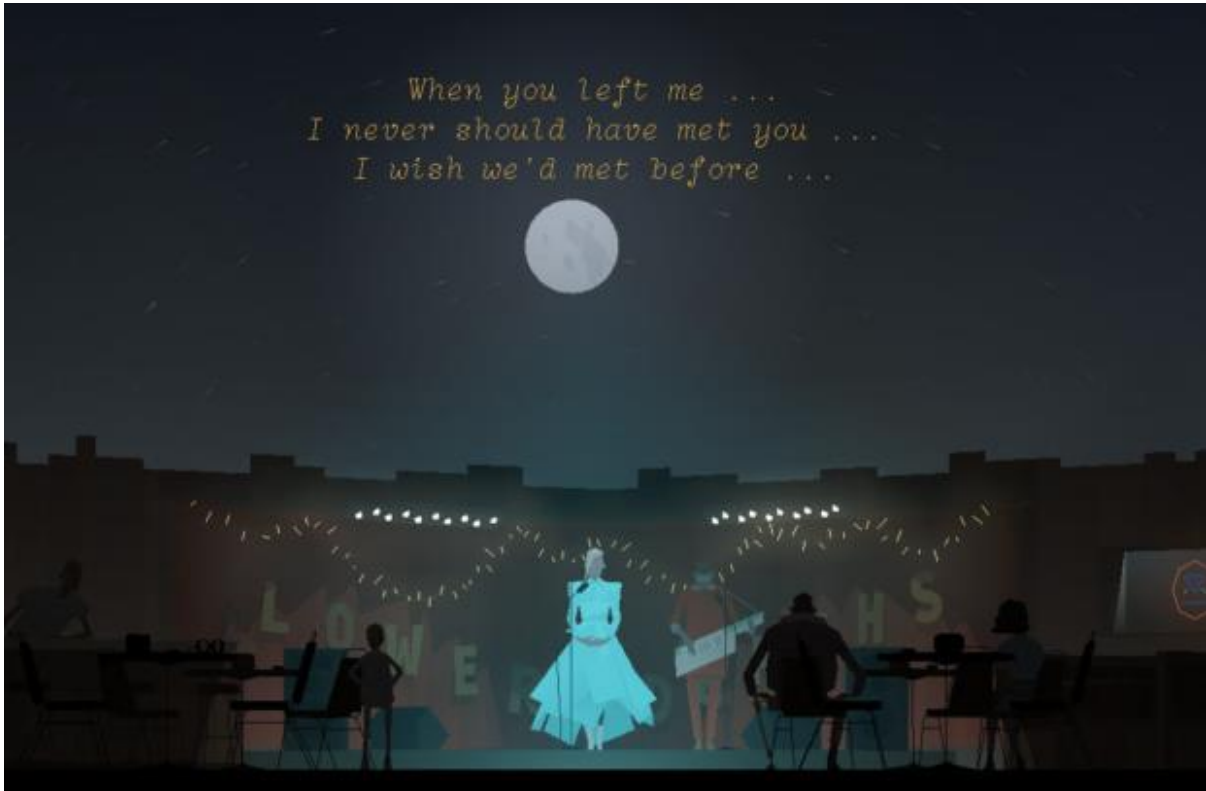
Image 5. Scene from Kentucky Route Zero Act III (2014). Performance of Junebug and Johnny at The Lower Depths, a bar reminiscent of Twin Peaks ' Bang Bang Bar.