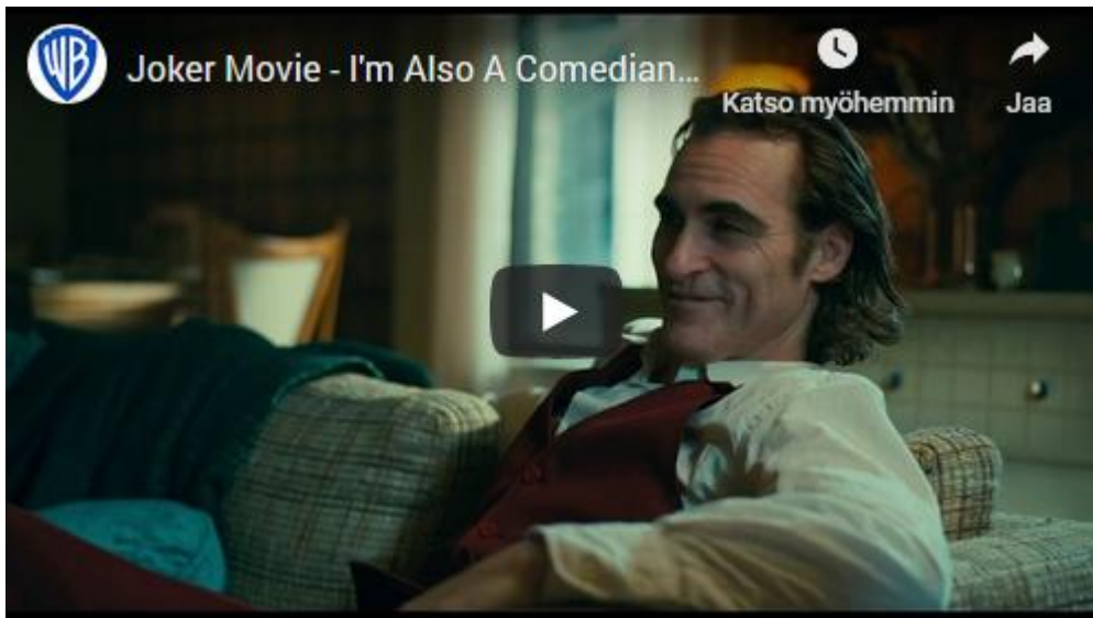
Video 2. AF rehearses his joke for the Murray Franklin Show . Source: https://youtu.be/7T0DuKpjDMY .

Even the worst and most immoral killings the Joker commits are now a source of amusement for him, part of his comedy. It is the “real him” that sits in the police car at the end of the movie and is overjoyed at the chaos he observes and of which he himself is the seed. The tendency to invert situations is also apparent in his clown name, Carnival. The name and the phenomenon known as Carnival make another direct reference to a state where the world is turned upside down to question prevailing norms, to break boundaries and to make the sacred profane; it is a state that eventually leads to ritual purification. [3]