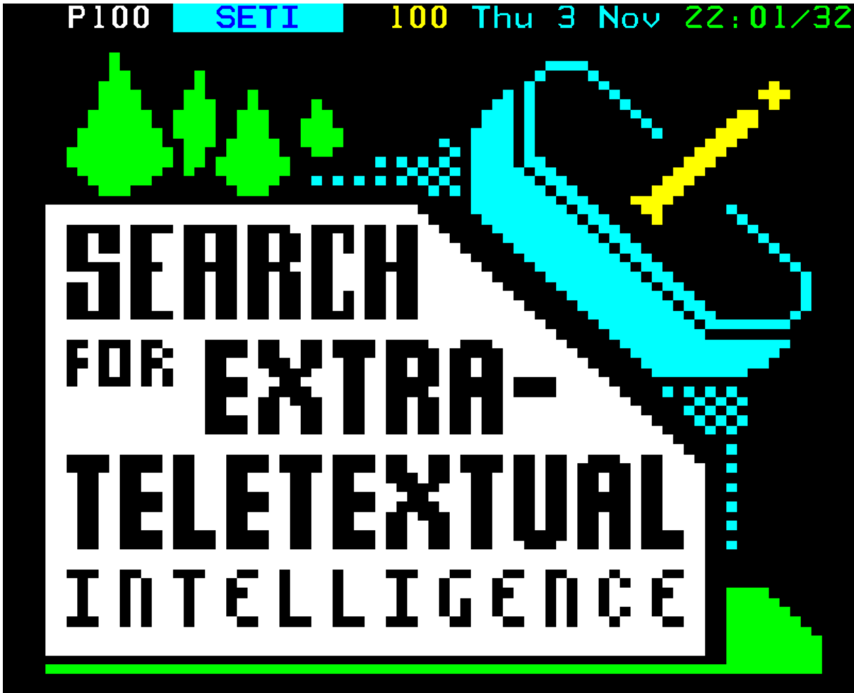
Figure 2. 100_02_Satellite