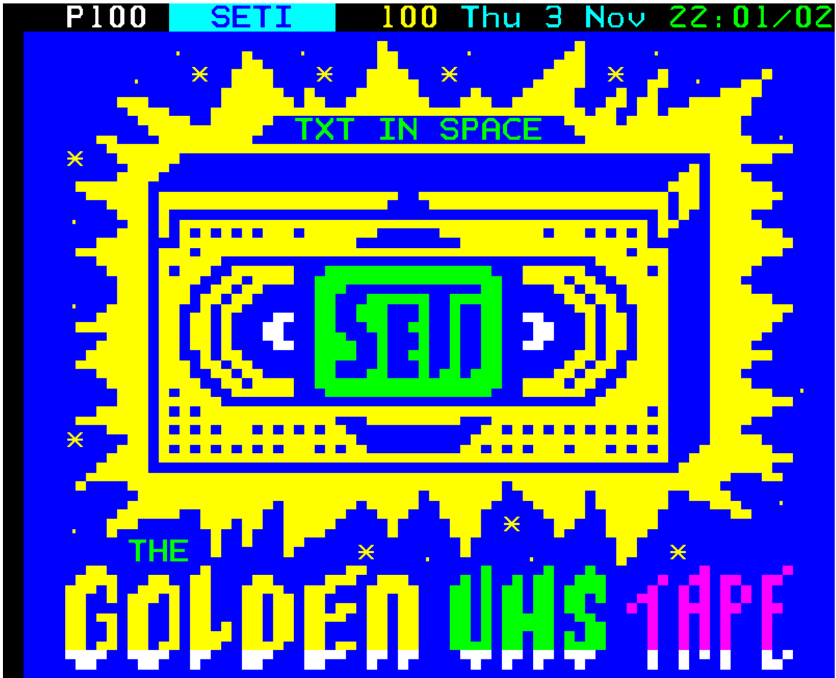
Figure 1. 100_01_Golden-Tape