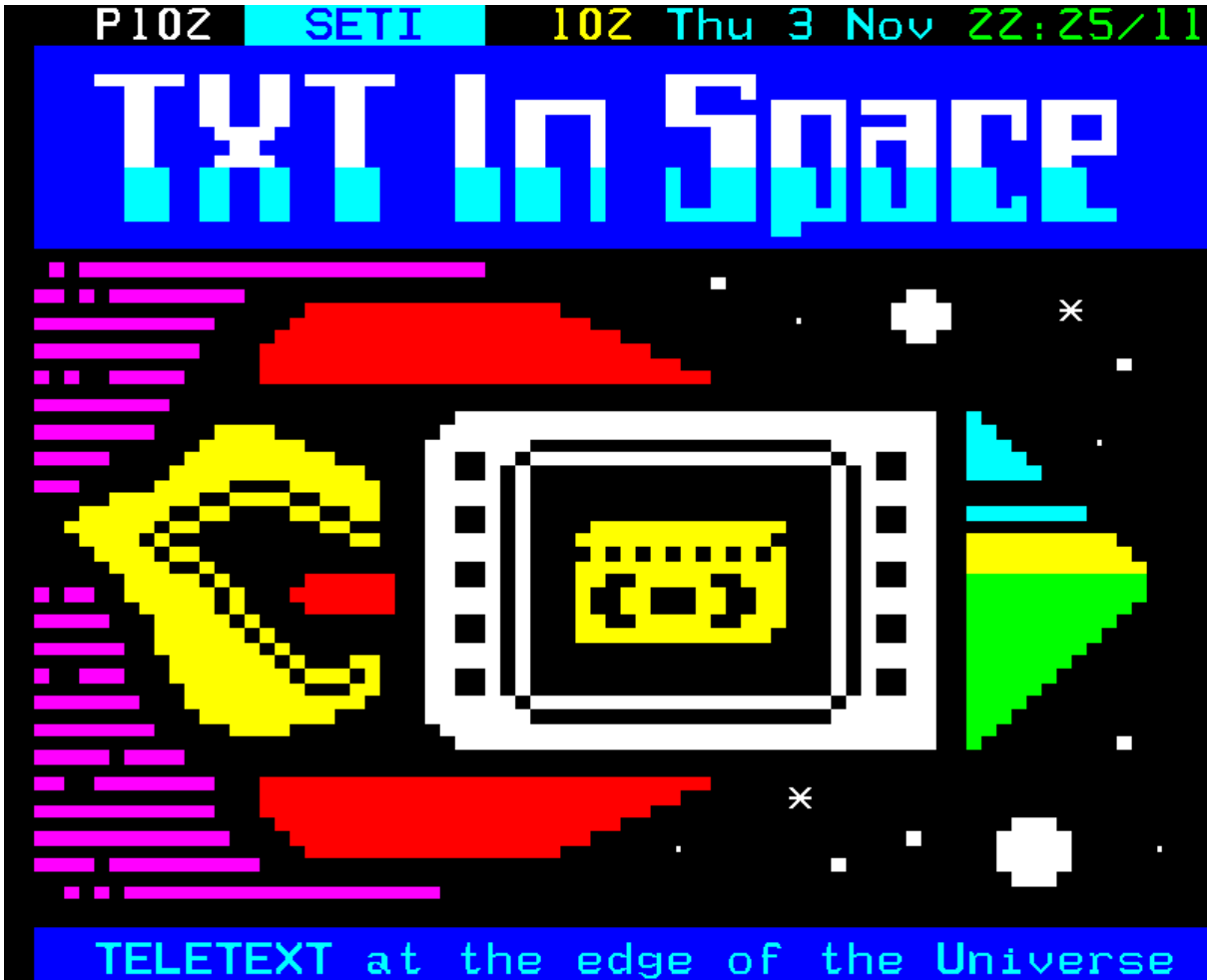
Figure 7. 102_02_Rocket