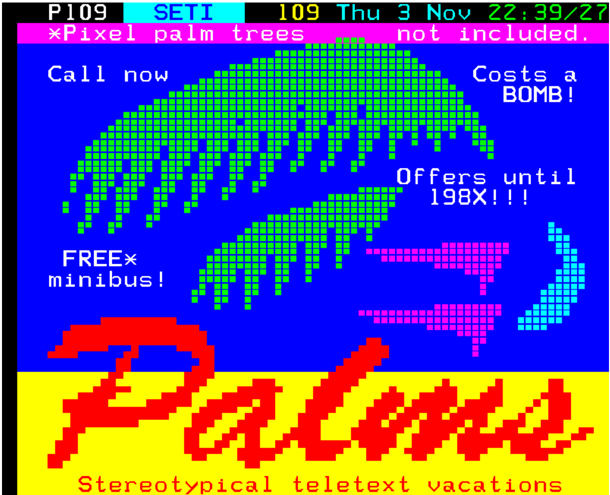
Figure 11. 109_02_Palms