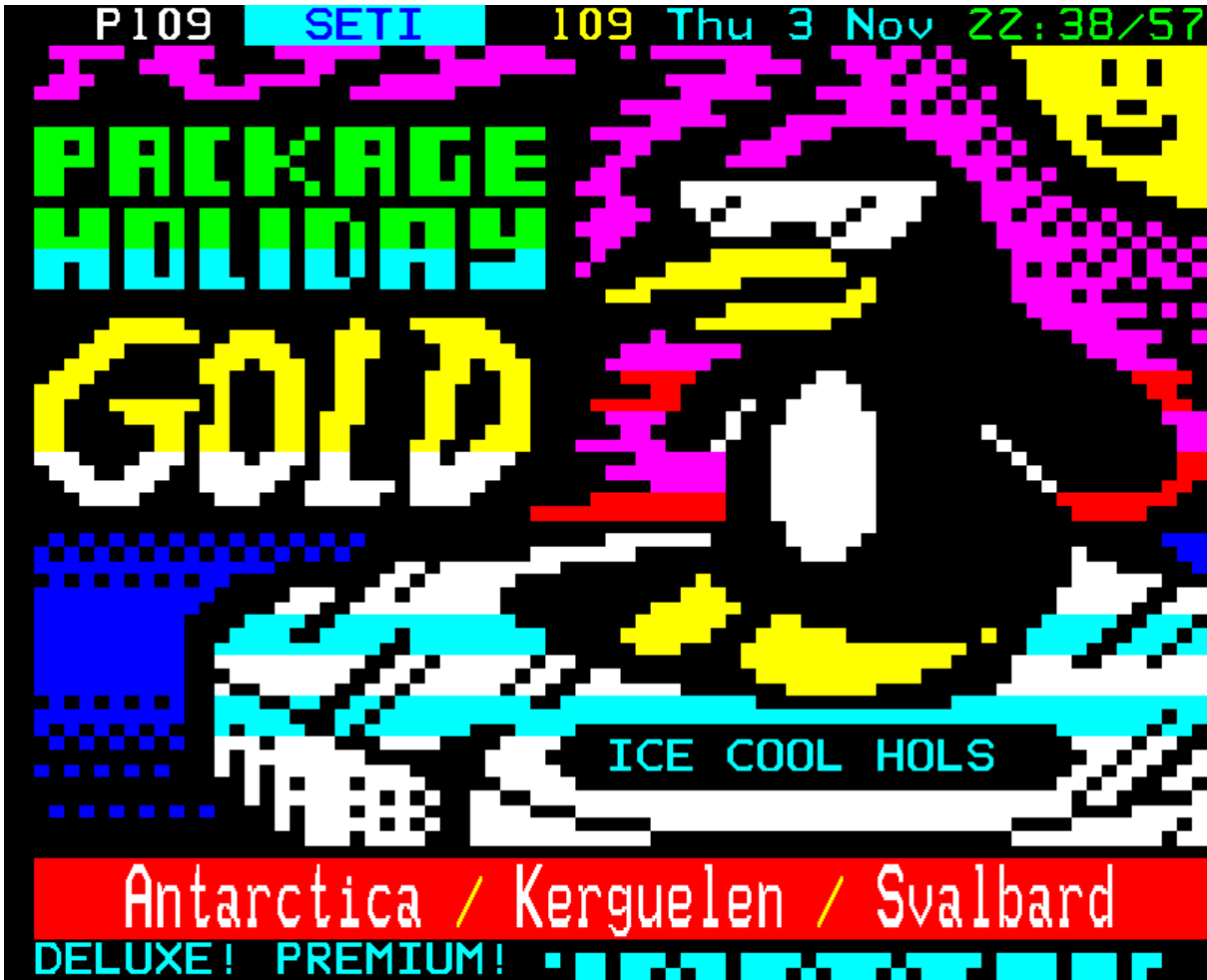
Figure 10. 109_01_Holidays