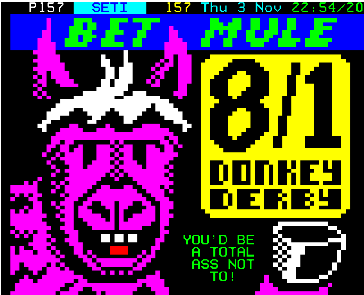
Figure 13. 157_01_Betmule