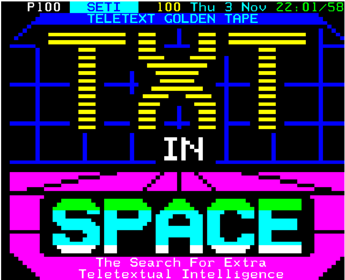
Figure 3. 100_03_Txt-in-space