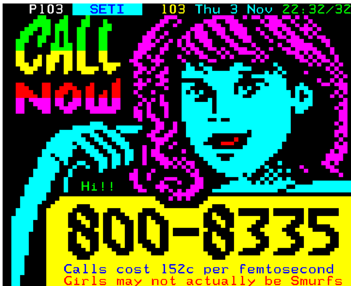
Figure 8. 103_01_Chat